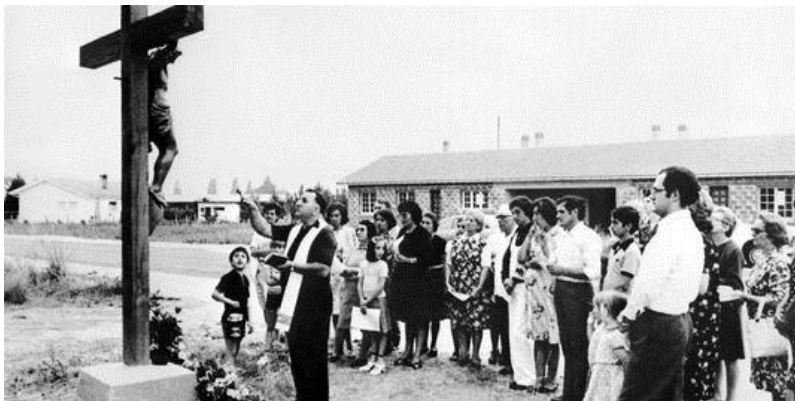
France, summer 1976

1976 : severe for NW Europe, last drought in memory for NWE?