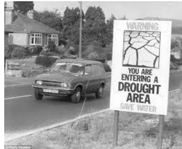
UK, summer 1976

1921 : -40% rainfalls from England to Italy ⇒ Famine in eastern Europe